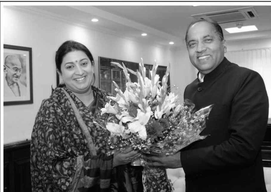
Himachal Pradesh Chief Minister Jai Ram Thakur calls on Union I&B Minister Smriti Irani in New Delhi on Tuesday.

It depends on our nature and sentiments that what we see in cinema and what we learn from watching cinema.