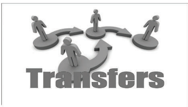
ministrative Reforms and member secretary, Haryana Governance Reforms Authority.