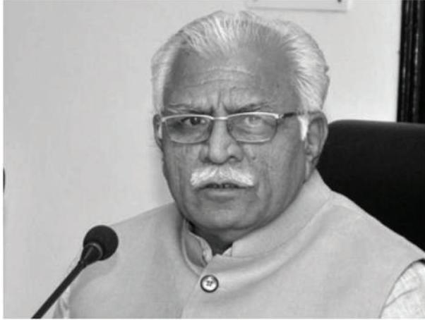
Chief Minister Manohar Lal Khattar made the announcement of establishing 'Haryana Kisan Kalyan Pradhikaran' while interacting with farmers during the 'Ek Aur Sudhar' programme organised here

TSN/Chandigarh Haryana will establish a farmers' welfare department to make agriculture remunerative, enhance productivity and mitigate the distress of farm households and landless workers, Chief Minister Manohar Lal Khattar said on Tuesday.